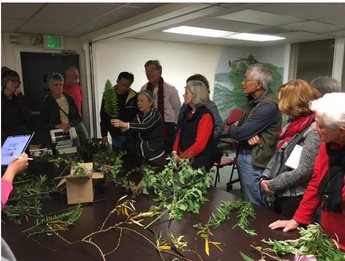
Plant Morphology session at the PCC, January 2018

We will go over the basics of Plant Morphology on Friday January 21 and the basics of Plant Taxonomy on Friday February 18 , from 6:30 – 8:30pm on Zoom .