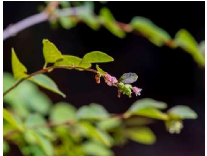
Charley Pow Common snowberry ( Symphoricarpos albus ) showing pink flowers at the tips of its drooping stems. The dark background is formed by the ground shaded by a coast live oak. Los Altos, September 2023

skills and learning more about our native plants. It is open to all. The group has monthly meetings and an active email list.