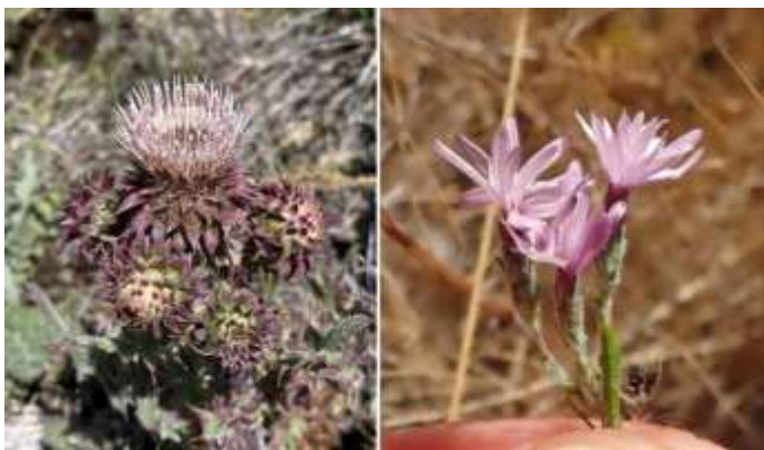
Dee Himes, left, Joerg Lohse CC-BY-NC 4.0, right Left: Fountain thistle flowering head, June 2021. Right: Crystal Springs lessingia September 2019. Yes, those are human fingers holding the tiny lessingia blossoms. Both pictured in the fountain thistle work area on Caltrans property.

Fountain thistle ( Cirsium fontinale var. fontinale ) is a federally endangered plant that grows in an unusual and specialized habitat – serpentine seeps – and is only found here and in a few other nearby locations on the Peninsula. Its recovery here is a restoration success story. Once almost completely displaced by jubata grass (Andean pampas grass), it has largely recovered at this location, as a result of the work done by CNPS volunteers in a cooperative project between our two chapters. However, fountain thistle is still under threat from invasion by new jubata grass seedlings, by other non-native plants, such as bristly ox-tongue and fennel, and by pioneering woody plants threatening to convert the area to shrubland or woodland.