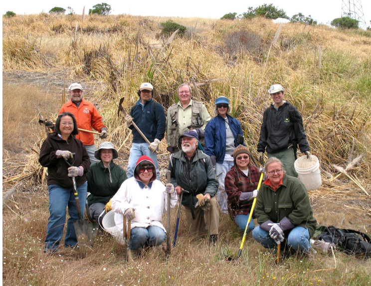
First fountain thistle work party, May 2008 near intersection of I-280 and Hwy. 92

We expect about 60 miles of driving round trip. Mount Hamilton Road is a steep, narrow, twisting mountain road. We'll form carpools at the meeting spot. Bring lunch, snacks, plenty of water, and two-way radios if you have them. Riders will share gasoline costs with drivers. We expect the trip to last until about 4pm or later .