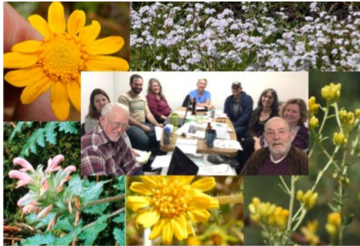
Rare plants adopted so far. Center: rare plant team meeting; upper left then clockwise: woodland woollythreads, Choris' popcornflower, Satan's goldenbush, Congdon's tarplant, Dudley's lousewort.